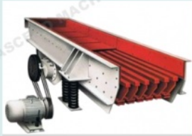
GZD Vibrating Feeder