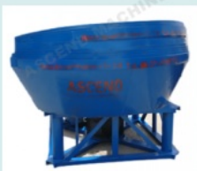
Wet Pan Mill