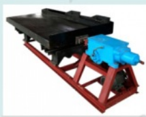
6-S Shaking Table