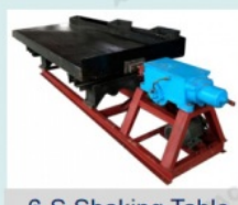
6-S Shaking Table