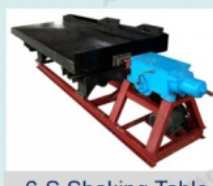
6-S Shaking Table