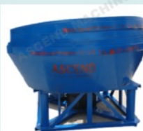
Wet Pan Mill