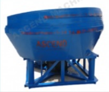
Wet Pan Mill