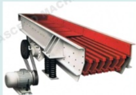
GZD Vibrating Feeder