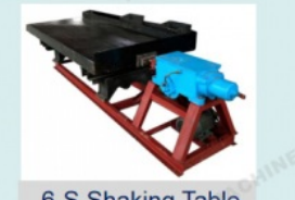
6-S Shaking Table