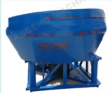
Wet Pan Mill