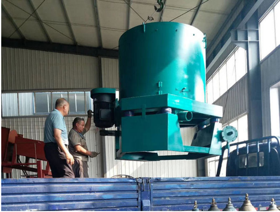
Gold sluice with blanket

Gold centrifugal concentrator is to use the gravity centrifugal force to collect the gold concentrate in the river sand or soil, it is suitable to collect the gold mesh size from 200 mesh to 40 mesh, the recovery rate for free gold particles can reach high to 90%, it is a perfect partner working with the gold trommel screen plant.