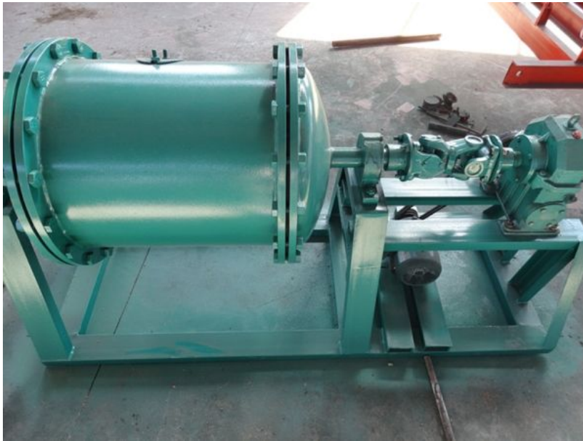
Electric gold melting furnace

After get the mixture of gold and mercury, you can put it in the elctric gold melting furnace and heat it, then you can get the pure gold bar.