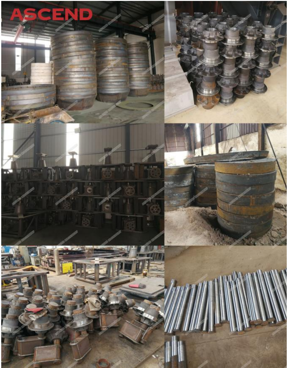
Package and delivery